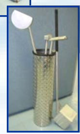
Submitted by Bert Leblanc